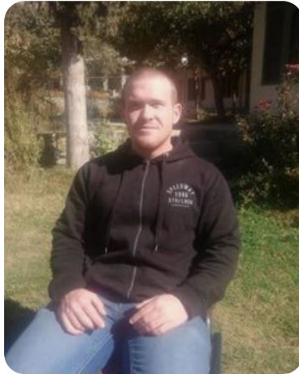
Cute People Men Christchurch >