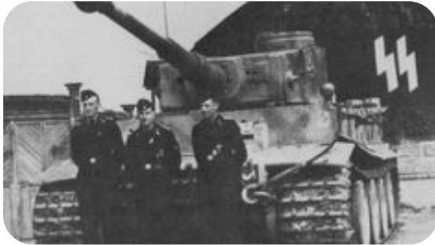
Tiger II Mg 34 German Soldiers >